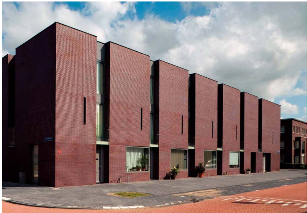
“Tussen den parken” Utrecht, Netherlands

In the Netherlands, GIA has been implemented to spatial planning proposals; suburban VINEX 4 -schemes, addressing public transport, regional and national development policies as well as the fifth National Spatial Framework [Hupe et al 2002]. The implementation came to a halt when the central bureau for emancipation was abolished.